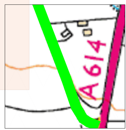
Existing 30 mph Speed Limit

© Crown copyright and database rights 2025 Ordnance Survey 100019713.