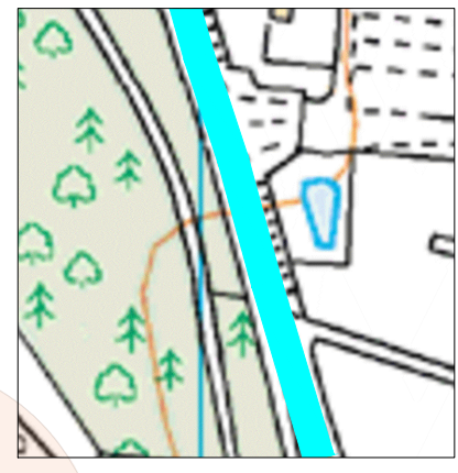
Existing 40 mph Speed Limit