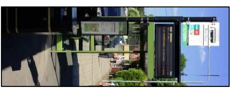
Example of a "Real Time" Pole