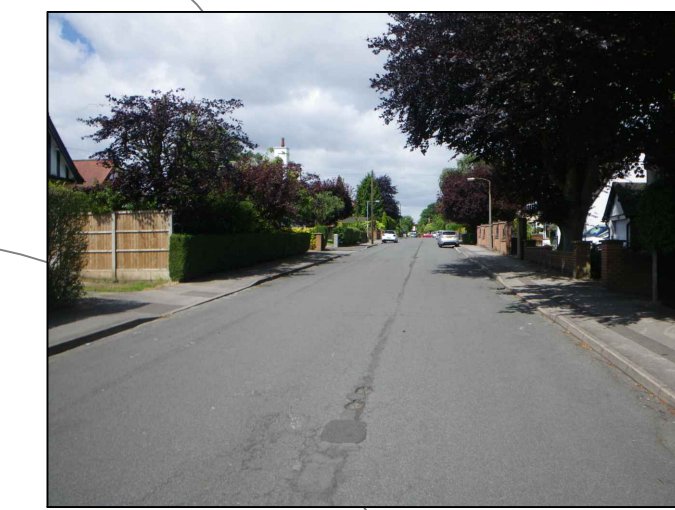
Representative view of road width & existing parking practices at the northern western end of Digby Avenue.

Proposal is to provide an on carriageway signed only route.