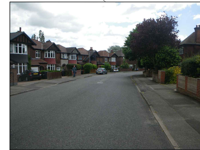
View of bend on Hazel Grove looking south east showing road width & visibility.

Existing crossing on Mapperley Plains Road. Potential to upgrade this to a toucan crossing if appropriate.