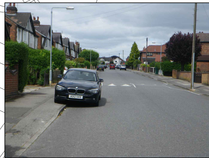
Representative view of road width, existing parking practices & traffic calming measures on Hazel Grove.